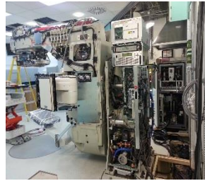
Linac True Beam Install .....2 machines @ £1.8m each